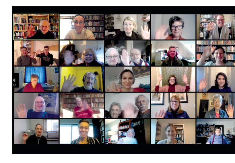
Shown above: Some participants in 'Coffee across Continents'.

One of the unexpected upsides to this year has been the breaking down of geographical barriers between Unitarian fellowships and groups. When we can meet